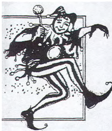
New York April Fools' Day Parade Jester

As the parade ends in Union Square, the party begins, featuring live music, food, concessions & entertainment. Peanut butter snacks will be available free to all, courtesy of the Peanut